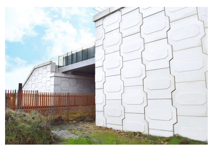
M11 Rail Bridge Scheme – asset International Structures Ltd asset VSoL Cross Panel.