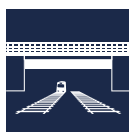
Bridge over rail