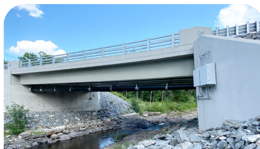
ASSET FRP BRIDGE BEAM