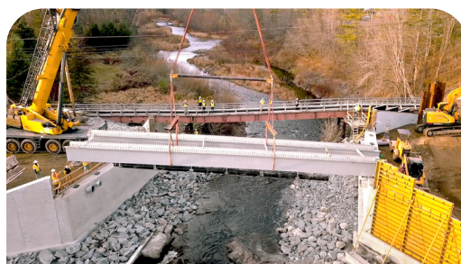
ASSET FRP BRIDGE BEAM