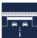
Bridge over road