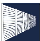
FRP King Post Walls