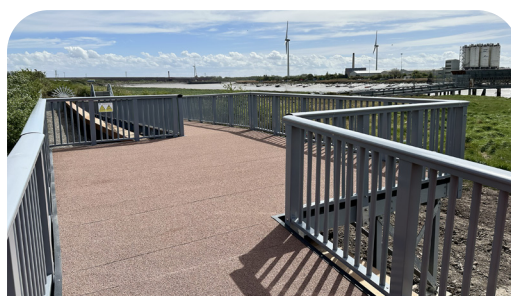
ASSET FRP PEDESTRIAN ACCESS BRIDGE