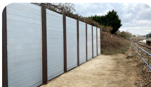
ASSET FRP KING POST RETAINING WALL