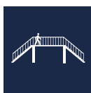
Pedestrian Bridge Decks